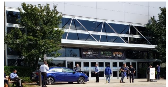
Suburban Collection Showplace, Novi, MI

THE BATTERY SHOW NORTH AMERICA 2018 September 11-13 Novi, MI Booth #1118 IRISO