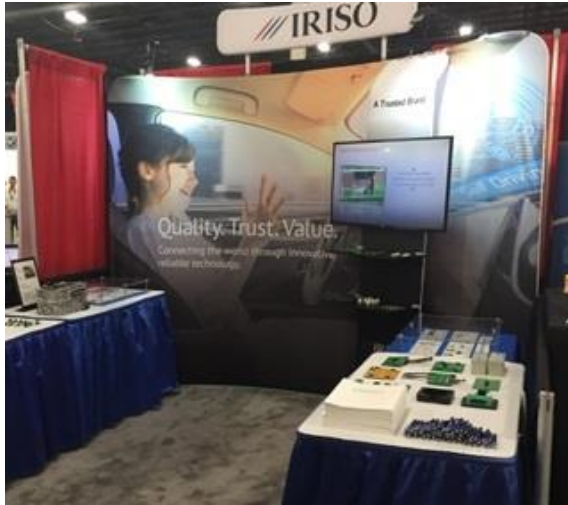
OUR BOOTH AT THE BATTERY SHOW – SEP 2018, NOVI, MI, USA