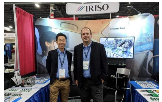
Posing for a quick pic in front of our booth